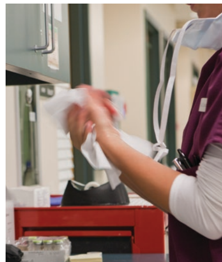
Kessler is creating a culture in which controlling and preventing infections is everyone's concern.

To decrease the potential exposure to influenza, Kessler strongly recommends the flu vaccine for all staff—not just the treating clinicians—and patients are educated on the importance of receiving the vaccine themselves. While patients and families cannot be forced to acquire the vaccine, such teaching