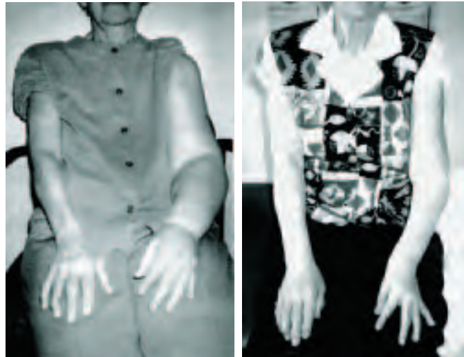
These “before-and-after” images show how lymphedema can be reduced if patients get the right combination of treatments.