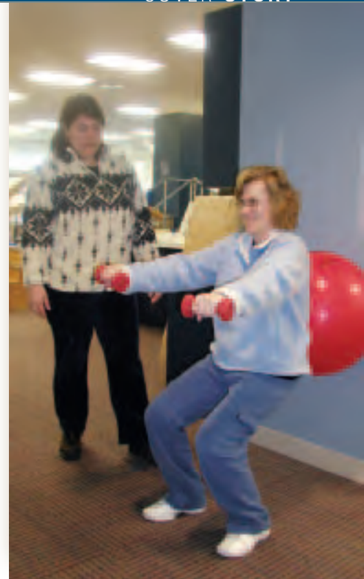
Rehabilitation can help the MS patient maintain strength and balance.

Despite the uncertain prognosis for the MS patient, research shows that early treatment is key and can help to slow the progress of the disease. The agents used to treat the